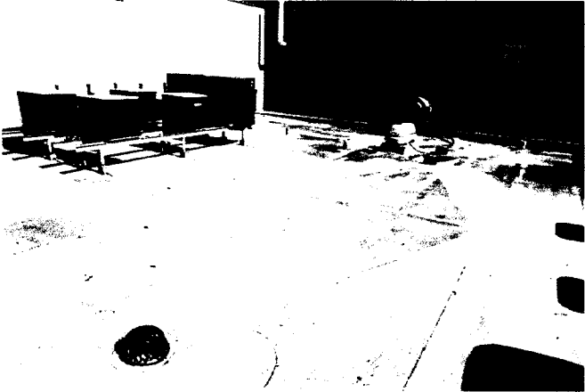
Poured concrete roof